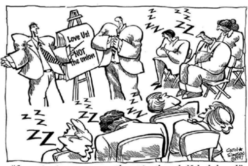
"Our anti-union message must be getting through. Nobody booed."

This committee will do the company's dirty work. They may distribute leaflets with lies about the IBEW, start rumors, or intimidate workers who support the IBEW.