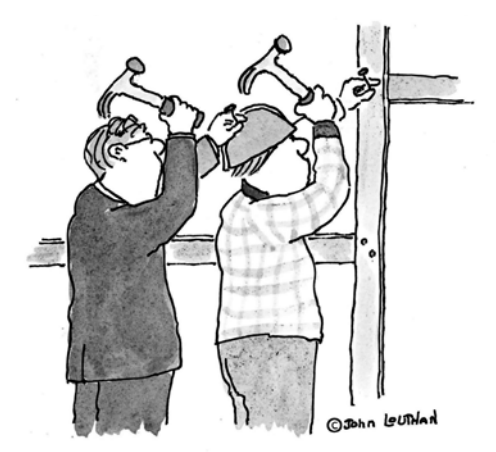
"Management and labor working in tandem." 16

Management may tell you that you will not be able to speak with your supervisors or managers and that you will have no control over what is decided in your workplace.