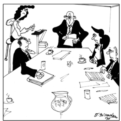
"Drop dead. Well that's a good start to our negotiations."

It is illegal for the company to say this to you directly, so instead management may say something like, "Remember, we don't have to agree to what you want in the contract."