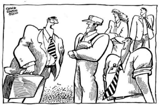
"...and stop smirking when I spread nasty rumors about the union. I have feelings too, you know."

The company will attempt to portray the authorization card as a legal document that makes you a member of the union and requires you to immediately begin paying dues—without the right to vote on a contract.