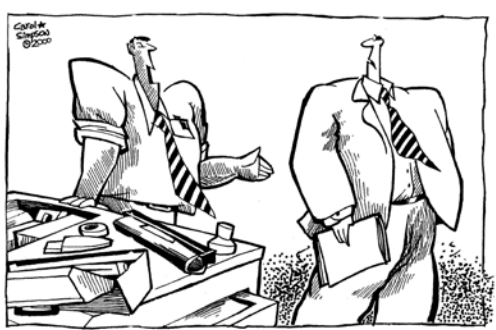
"You shouldn't have told the employees to 'work smarter.' They all went and joined a union."

Management may tell you that you will never get any benefit from paying union dues.