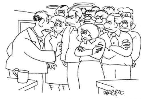
"YOU CAN'T VOTE TO LINIONIZE - YOU'RE ASSOCIATES NOT EMPLOYEES!"

This booklet can help you anticipate how the company will respond to your demand for democracy in the workplace.