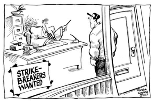
"We're not asking you to sell your soul.... we'd just like to rent it for a while."

Management may tell you that while you are out on strike you will be permanently replaced. They may ask how you will support yourself and your family if you are forced to join the strike.